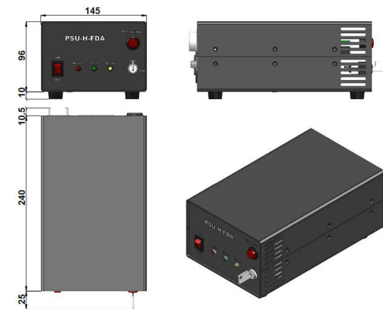
275.5 (L) × 145 (W) × 106 (H) mm 3 , 2.5 kg