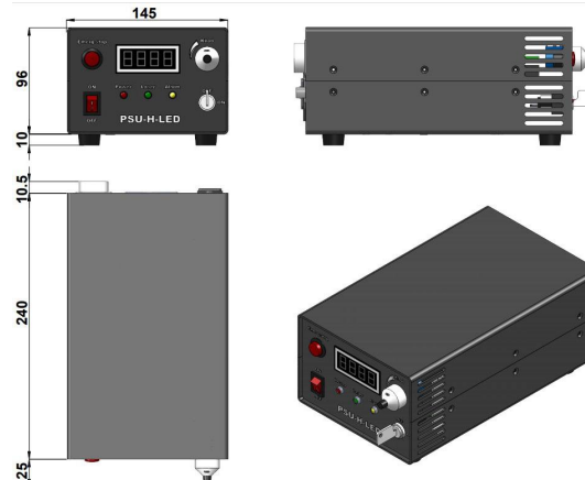
275.5 (L) × 145 (W) × 106 (H) mm 3 , 2.5 kg