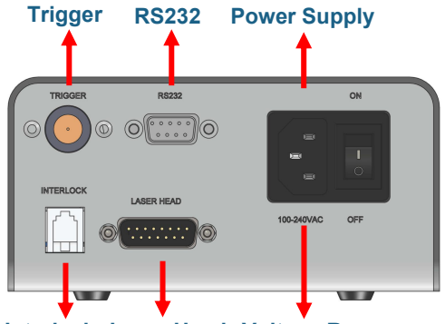
Interlock Laser Head Voltage Range