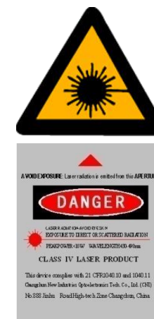
FC-W-445C (Air cooled)