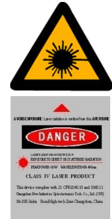
FC-W-447C (Air cooled)